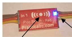
Sensor location "Sense"